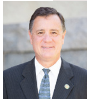
Orange County Supervisor, Third District

“The 250th anniversary of the Declaration of Independence invites us to reflect not only on the words that launched a nation, but on the enduring promise of America itself. As a child airlifted from Vietnam, I arrived with nothing. Yet this country gave me a home, an education, and the freedom to pursue a life of purpose. My story is one of many that speak to the transformative power of the American promise – a promise we honor through USA250-OC.”