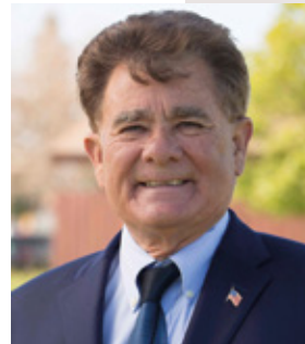
Chairman, Orange County Board of Supervisors, Fourth District

“USA250-OC provides the perfect opportunity for the people of Orange County to come together to reflect on the history of our country and the principles on which it was founded, to share our common rights and responsibilities as Americans, and to advance the ideals and aspirations embodied in the Declaration of Independence, the Constitution and the Bill of Rights.”