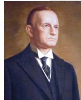
President Calvin Coolidge (1926)

"A proclamation inviting the people of the United States to offer "devout thanksgiving to Almighty God for the blessings which have been bestowed upon us as a nation during the century of our existence, and humbly to invoke a continuance of His favor and of His protection."