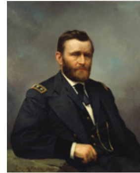
President U. S. Grant (1876)

"A proclamation inviting the people of the United States to offer "devout thanksgiving to Almighty God for the blessings which have been bestowed upon us as a nation during the century of our existence, and humbly to invoke a continuance of His favor and of His protection."