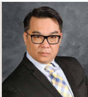
Orange County Superintendent of Schools

We focus on the structure of government embodied in the Constitution and the Bill of Rights, their enduring impact, and the historic role of the people of Orange County in the history and development of the United States.