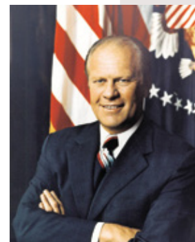
President Gerald Ford (1976)

"There is something beyond the establishment of a new nation, great as that event would be, in the Declaration of Independence which has ever since caused it to be regarded as one of the great charters that not only was to liberate America but was everywhere to ennoble humanity."