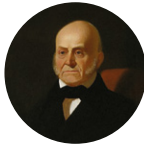
J. Quincy Adams